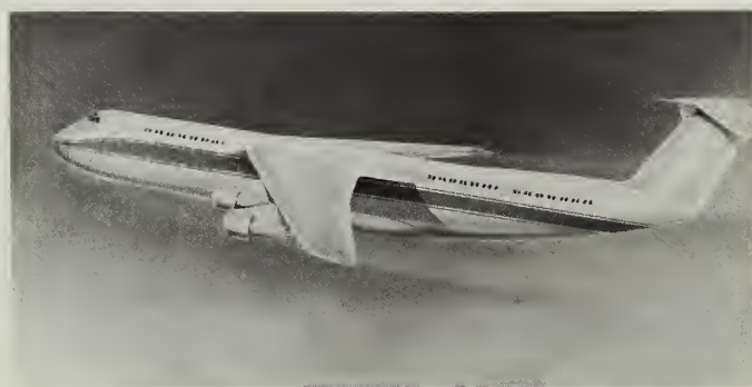
Two of tomorrow's jumbo airfreighters, which will thrive on huge cargo volumes. Top, artist's conception of B-747 being loaded by means of an in-plant conveyor system. Below, the L-500, commercial version of the military C-5A.

favorable shifts in conditions in markets they serve.